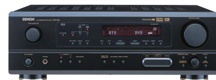
Front panel with terminal cover.

*Design and specifications are subject to change without notice.