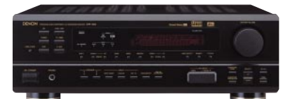
Front panel with terminal cover.

*Design and specifications are subject to change without notice.